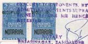
Ил. 16. Специальное право поверенного: Доверенность на имя Правления Международного Центра Рерихов. Бангалор. 27 апреля 1992 г. // Архив МЦР. Оп. 4. Д. 7-3. Л. 3