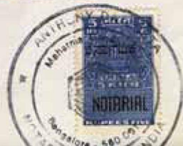
Ил. 10. Завещательное распоряжение С.Н. Рериха «Архив и наследство Рериха для Советского Фонда Рерихов в Москве». 19 марта 1990 г. // Архив МЦР. Оп. 4. Д. 5-1. Л. 3